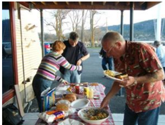
Sock Burning 2010