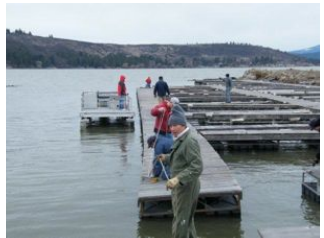
Work Party Action Shots